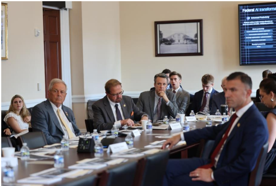
Photo: Members of the House Budget Committee held a roundtable titled “The Age of Artificial Intelligence: Implications for the U.S. Economy and Government.”