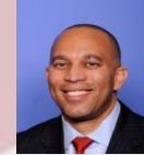
Hakeem Jeffries NY-08