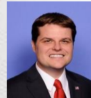
Matt Gaetz FL-01