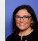
Suzan DelBene WA-01