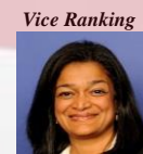
Pramila Jayapal WA-07