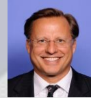
Dave Brat VA-07