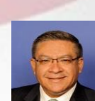
Salud Carbajal CA-24