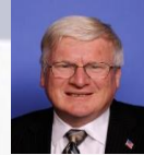
Glenn Grothman WI-06