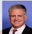
Drew Ferguson GA-03