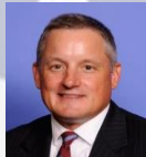
Bruce Westerman AR-04