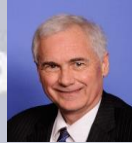
Tom McClintock CA-04