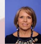
Michelle Lujan Grisham, NM-01