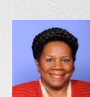
Shelia Jackson Lee, TX-18