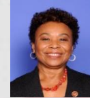
Barbara Lee CA-13