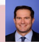
Seth Moulton MA-06