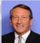
Mark Sanford SC-01