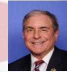
John Yarmuth KY-03