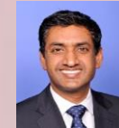
Ro Khanna CA-17