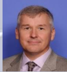
Rob Woodall GA-07