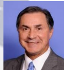
Gary Palmer AL-06