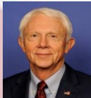
Jack Bergman MI-01