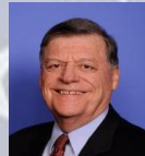
Tom Cole OK-04