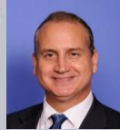
Mario Diaz Balart, FL-25