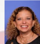
Debbie Wasserman Schultz, FL-23