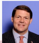
Jodey Arrington TX-19