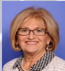
Diane Black TN-06